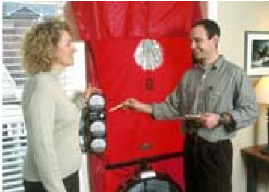
A certified Green$aver Advisor conducts blower door test

The blower door test slightly depressurizes the house, allowing Green$aver's expert to immediately detect sources of air leaks and drafts.