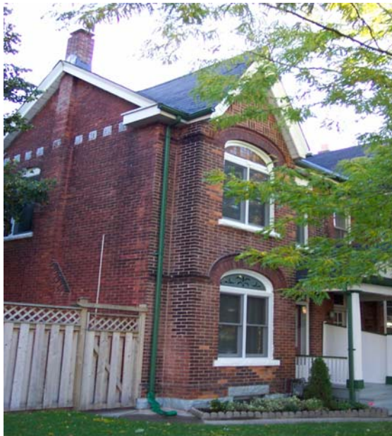
Similar housing in the Bloorcourt neighbourhood.

Marion's wood-framed house is approximately 1825 sq. ft. including the basement. It is heated with a low-efficiency gas furnace. The majority of the insulation in the walls was merely R12 however, the cathedral roof was fully insulated.